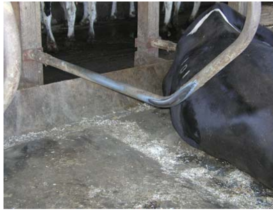
Figure 2. Brisket locators higher than 4 inches above the stall surface impede the forward thrust of the front limb when rising. Cows will tend to lie diagonally across the stall to give themselves more room. Note the long lower divider rail is rubbed shiny from cows lying against it.

We have also begun to appreciate more the impact of how the stall area is defined on cow movement and behavior. The brisket locator should be no higher than 4 inches above the stall surface so that the cow could lie with one forelimb extended if she chose to, and be able to thrust the fore-limb forward during the rising motion 8 . This forward thrust over the top of the brisket locator is a vital behavior that we would do well not to inhibit. Failure to provide for this movement is one of the major factors influencing how the cow positions herself in the stall. In stalls with high brisket locators, or where concrete has been filled above the level of the stall behind the brisket locator, cows will tend to lie diagonally in order to create a little more space for front leg movement when rising, along the diagonal (figure 2).