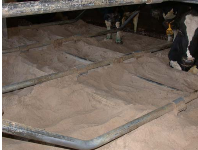
Figure 3. A horizontal mounting bar is retained in this stall, but mounted below the bedded surface in a sand free stall. The bedding has been moved to show the bar and the right angle mounting bracket.

We appreciate that the horizontal mounting bar makes construction easier, however, when mounted in the area at the end of the lunge between the stall platform and a height of 40-42 inches above it (referred to as the ‘bob zone’), they will impede the movement of the head when lying down and rising, and force more side-lunging. New stall dividers have improved vertical attachments that are mounted into the stall platform. One sand stall facility used a right angle mounting attachment to drop the horizontal bar down below the bedded level (figure 3). Both designs have been successful.