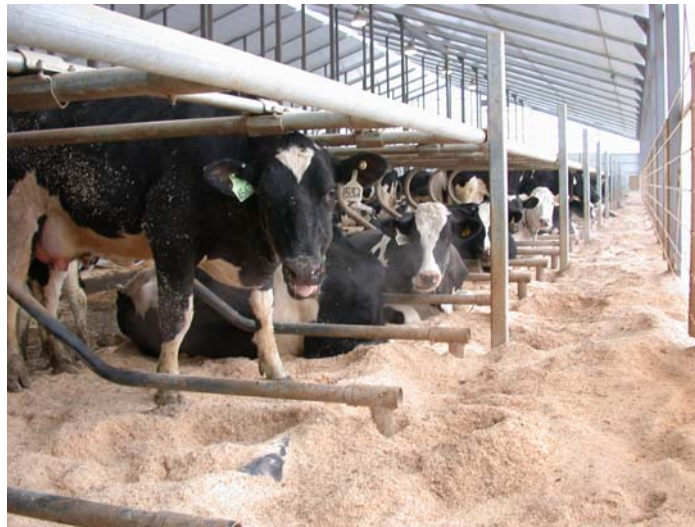
Figure 4. An open front stall against a side wall, with dividers mounted to provide space for front lunging.

It is questionable whether we should continue to build stalls in which cows must side lunge, however, it is clear that in most situations we must provide the cow with the option to do so if she chooses. The recommendation to make sure that the height of the upper edge of the lower divider rail is no higher than 11 inches above the stall surface at the position of the brisket locator remains a useful rule of thumb, and creates problems for many loop designs that cannot achieve this dimension without the neck rail being mounted too low. We have come to realize that not all wide loop dividers are created equally. The opening of a 2 3/8 inch outer diameter wide loop divider should be at least 35 inches and loops with narrower openings should not be used for mature cows. It is also important to leave a 5 inch space between the lower edge of the lower divider rail and the top of the brisket locator – this allows cows to work their leg free if it should get stuck between the two.