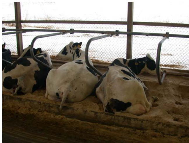
Figure 1. Re-modeled sand stalls 50 inches wide in a mature cow free stall pen.

When assessing the surface of the stall, we must now be mindful of both surface cushion and traction, and we therefore do not recommend the use of smooth covered, firm mattresses and rubber mats.