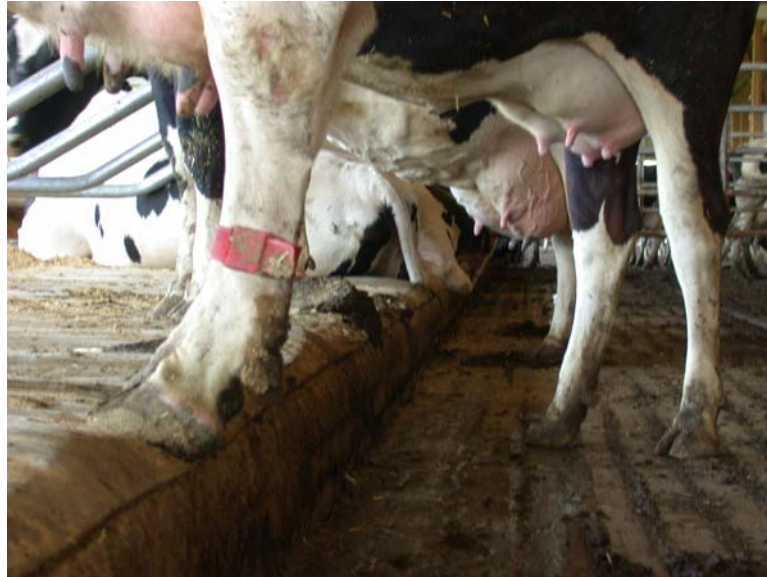
Figure 7. Whether a cow stands with all four feet on the stall platform or perches, with the rear feet in the alley, is probably a function of poor stall design and lameness.

We believe that many of the cows that become entrapped in poorly designed stalls do so because they are lame and are struggling to get up in the stall. Many of these cows end up too far up the front end of the stall and struggle to free themselves. In addition, difficulties rising mean that the lower rear limb is dragged across the stall surface, increasing hock damage. It is noticeable that many of the cows with the worst hock swellings are those that are also foot lame.