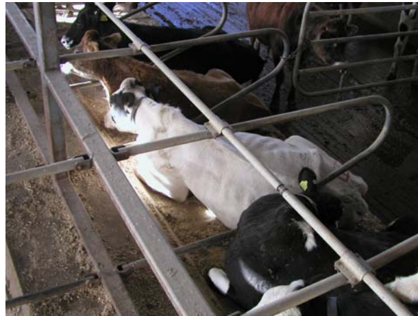
Figure 6. Cows lying diagonally across stalls that are head to head layout, with a bob zone obstruction and concrete fill behind a high brisket locator.

Diagonal lying is a complex issue caused by a variety of stall design factors – involving lunge space, standing position, brisket locator design and social obstructions (figure 6). The stall design must allow for the normal rising and lying movements of the dairy cow. In particular, we must provide forward lunge room for the head, an unobstructed bob zone and we must allow for the forward stride of the forelimb as the cow rises, so that the leg can take the weight of the cow and facilitate the rising motion. Diagonal lying is a response by the cow to a failure to meet some or all of these requirements and we have included a flow diagram to help the investigator consider the possible causes and solutions.